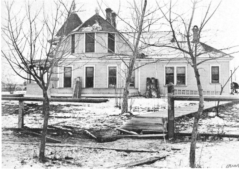
Blown up gate at Steunenberg's home in Caldwell, Idaho.

behest of that union's leadership. Steunenberg's murder, according to Orchard, was revenge for his having busted a miners strike in northern Idaho in 1898.