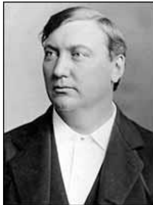
Former Idaho Governor Frank Steunenberg.