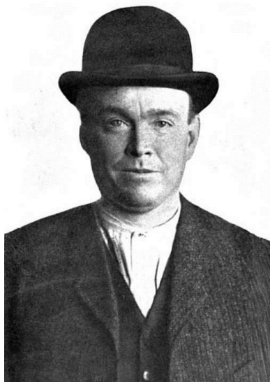
Albert Horsely, aka Harry Orchard.