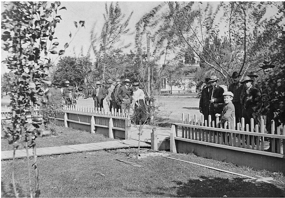
Dynamite bomb was attached to damaged fence post.